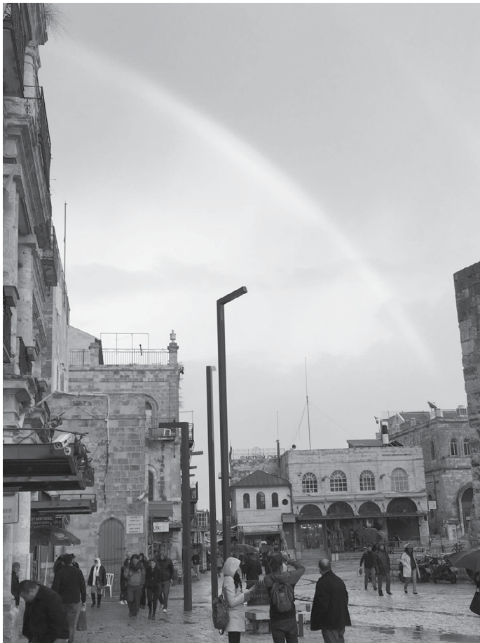
Rainbow over the Old City, February 2016