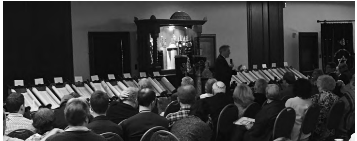
Torah scroll exhibit at LCJE-NA February 2016 conference in Dallas