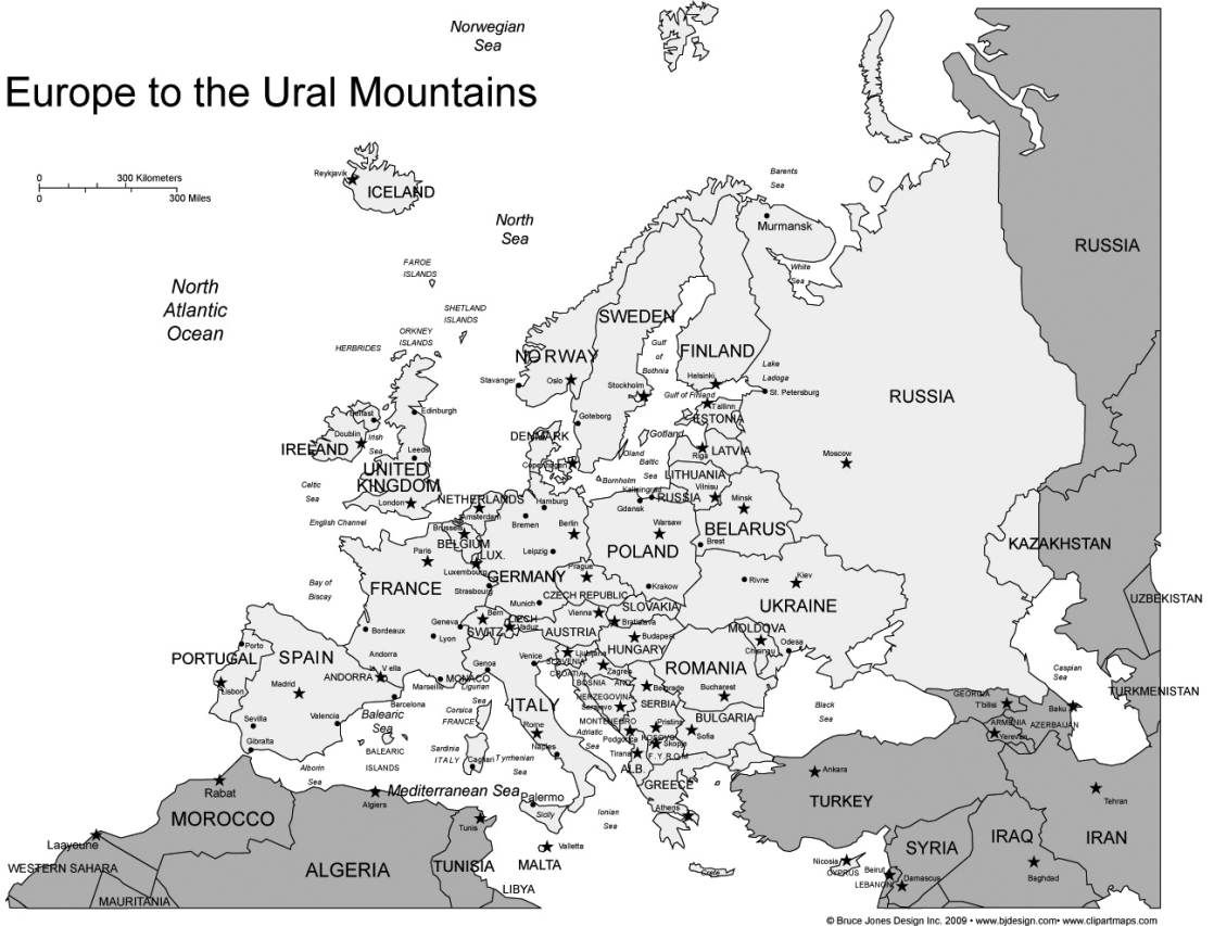
Map by B1Design.com