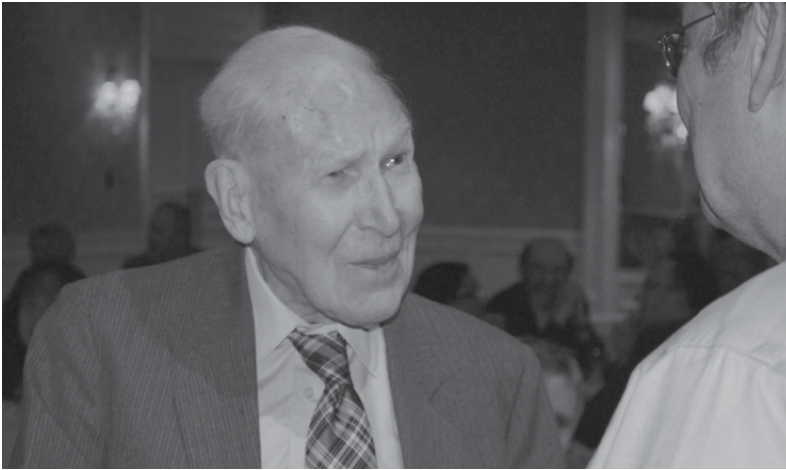
J. I. Packer at our 2015 LCJE North America conference in Vancouver